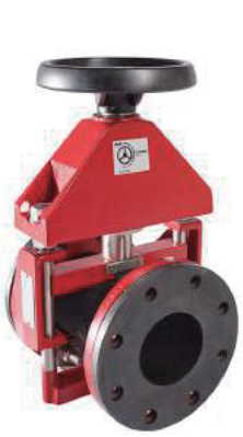
PV Operated by Manual

are ideal for handling abrasive or corrosive slurries, powders or granular substances.