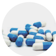
Food & Pharma