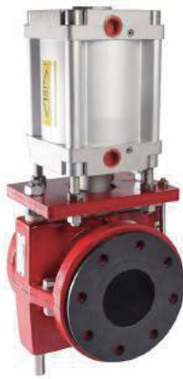
PVE Pneumatic Actuated