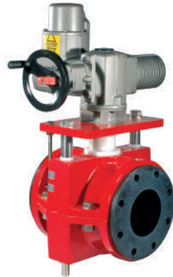
PVE Electric Actuated